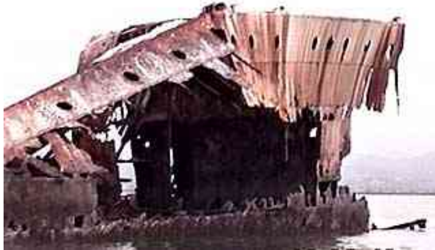
(Photograph taken 2000. Courtesy of Jon Hunolt)

In 1930, the London Naval Treaty reduced the amount of naval tonnage each nation could have. The USS Thompson was a casualty of that Treaty. The USS Thompson was decommissioned in 1930. The more useful parts of the ship were removed at Mare Island and the ship was put up for sale. In June of 1931, the USS Thompson was sold and became a floating restaurant on the southern part of the Bay.