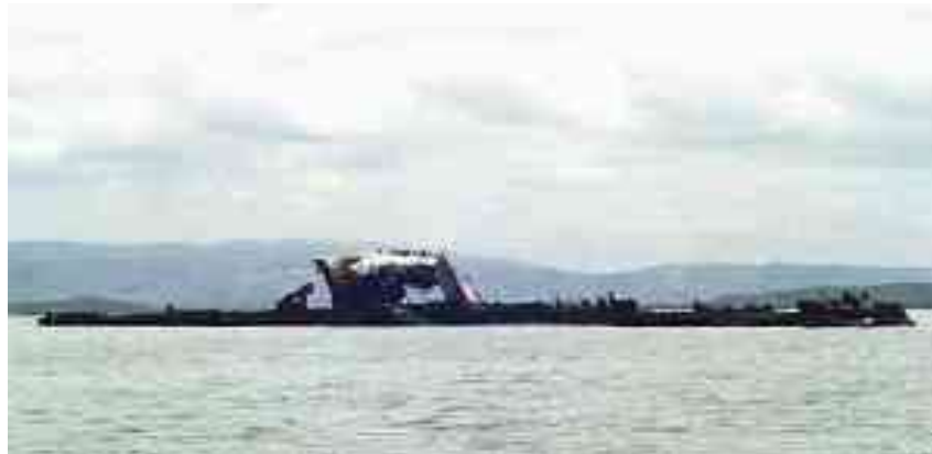
(Photograph taken 2000..)

In 1930, the London Naval Treaty reduced the amount of naval tonnage each nation could have. The USS Thompson was a casualty of that Treaty. The USS Thompson was decommissioned in 1930. The more useful parts of the ship were removed at Mare Island and the ship was put up for sale. In June of 1931, the USS Thompson was sold and became a floating restaurant on the southern part of the Bay.